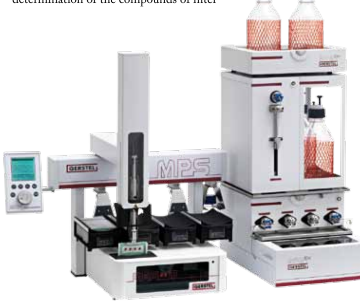
Fully automated DBS system based on the MultiPurpose Sampler (MPS).

absorbed on a suitable, cellulose based medium is all that is needed for a successful determination of the compounds of inter-